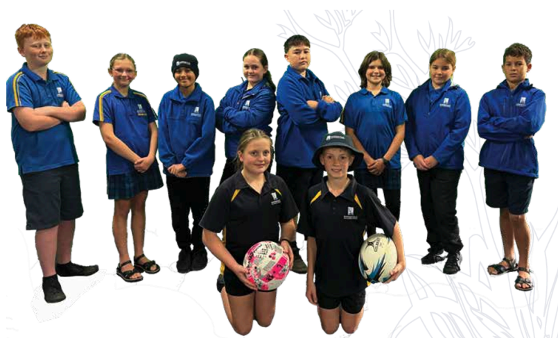
Photo from the school prospectus of students wearing our school uniform

In summary, we encourage our students to wear their uniform with pride, always, as it reflects the high standards we have for our tamariki, both in and out of the classroom.